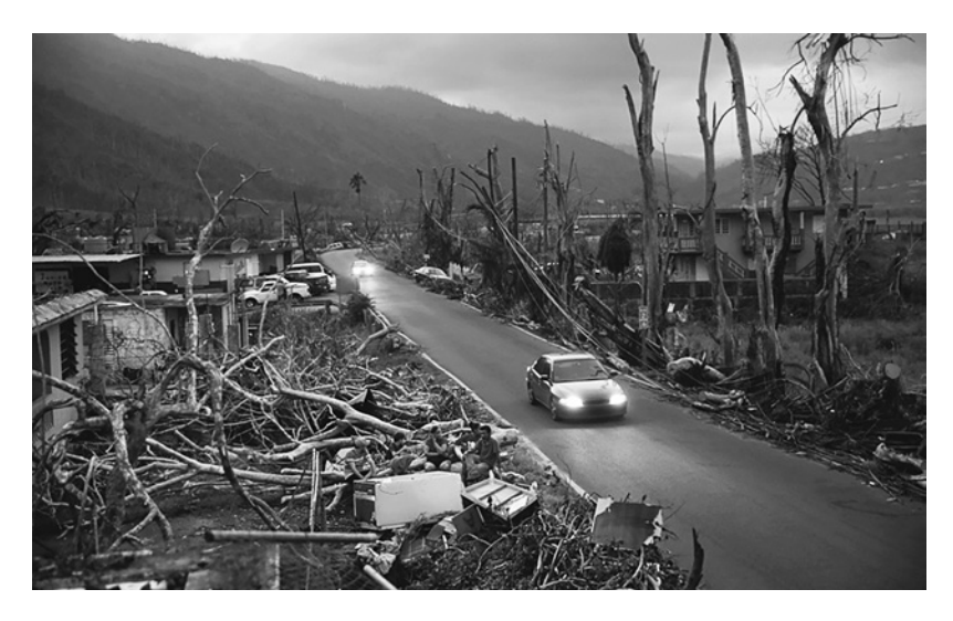
2.2 Hurricane María. Yabucoa, Puerto Rico, September 26, 2017.