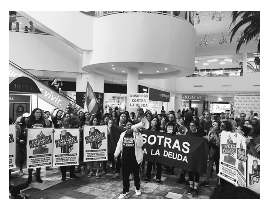
3.2 Embargo Feminista. La Colectiva Feminista en Construcción. Plaza las Américas, San Juan, Puerto Rico, March 8, 2019.

Rodríguez-Casellas writes, these are the real cuponeros .<sup>162</sup> The Feminist Embargo opened up a space and time of reckoning, then. The deferral, the diversion, that debt produces to exercise its power was amplified, opening up a space and time of giving accounts, of holding accountable. Such reckoning addressed not only financial debt but also historical, indeed colonial, debts. It indexed not the historical root of financial debt in the crisis, but the continuation of a history of colonial violence in the housing crisis.