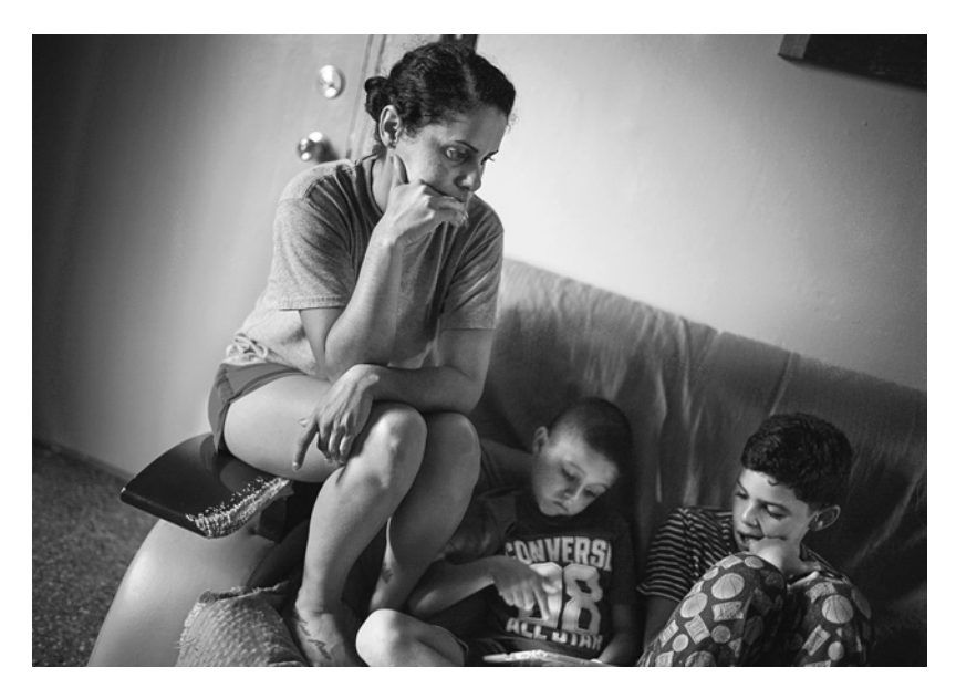
1.1 Source: "A Surreal Life on the Precipice," The New York Times , August 6, 2016.