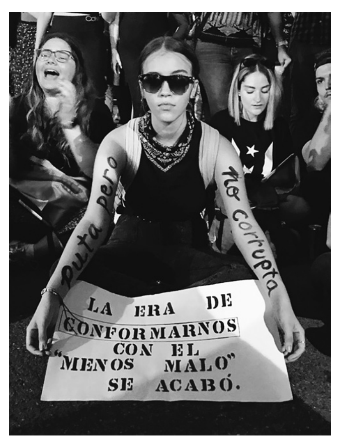
1.3 & 1.4 San Juan, Puerto Rico, July 2019.