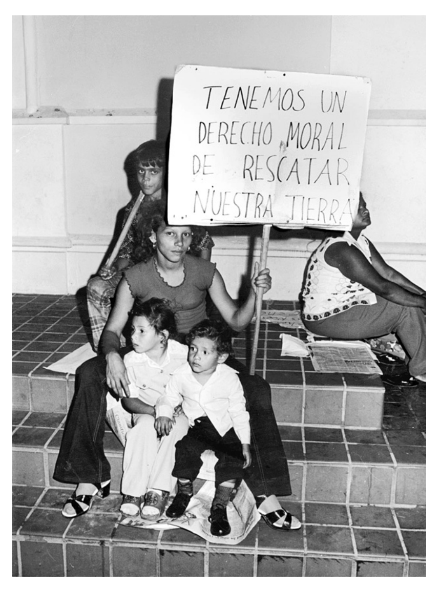
C.2 "We have a moral right to rescue our land" (Tenemos un derecho moral de rescatar nuestra tierra). Photo from Desalambrando: The Documentary , 2017.