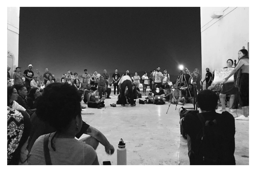
I.6 Caguas, Puerto Rico. Asamblea de Pueblo (town assembly), August 3, 2019.