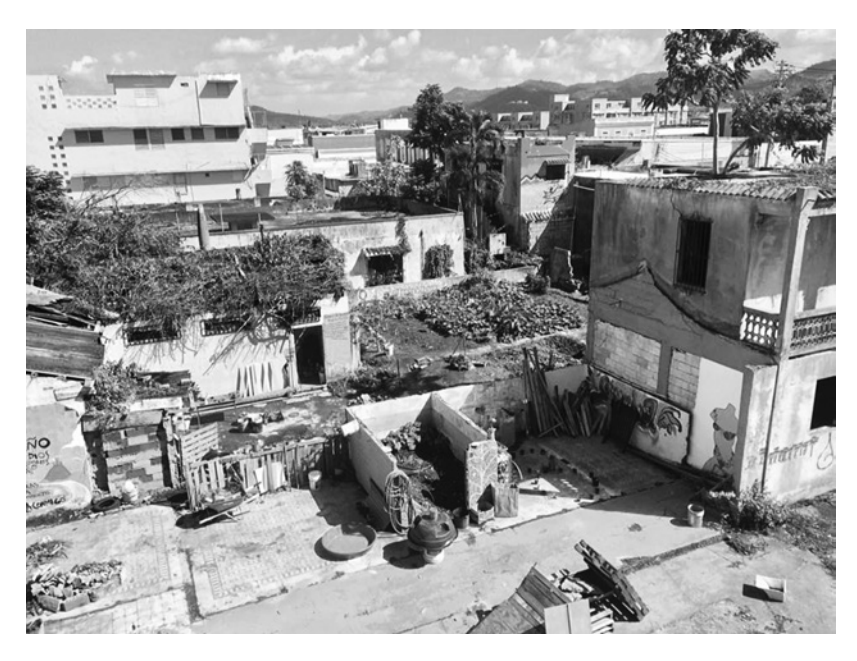
C.4 Huerto Feliz, Urbe Apié. Caguas, Puerto Rico.