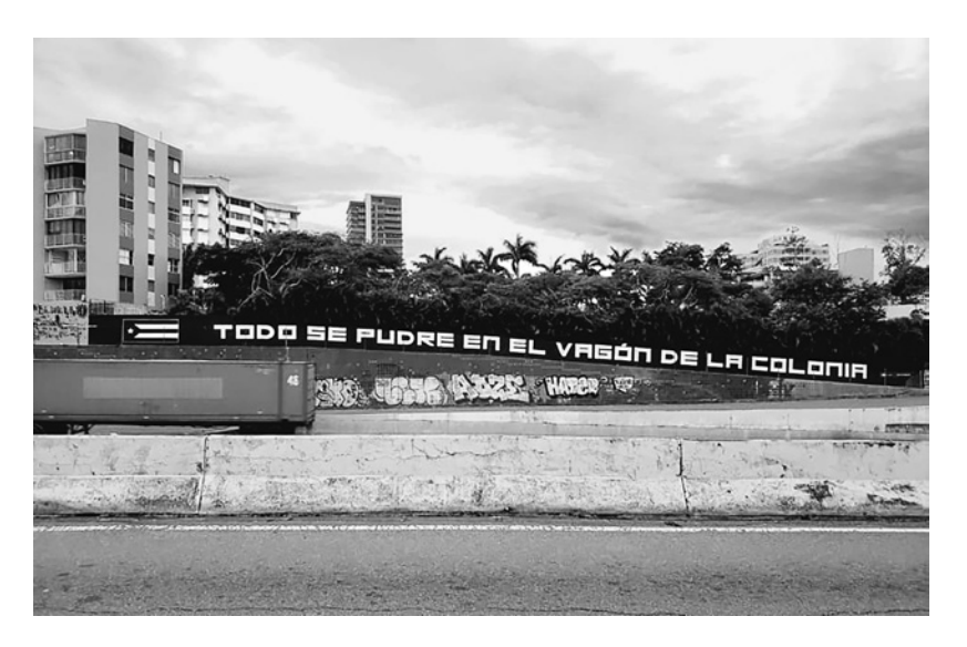
C.1 "Todo Se Pudre en el Vagón de la Colonial" (Everything rots in the colonial container/colonial containment), La Puerta. San Juan, Puerto Rico, November 20, 2018.

This requires more than writing the history of those who suffered the violence that founded the modern capitalist world in their singularity. To make memory, to turn the present into the past, is to attend to the lives that live modalities of this violence today. Attending requires dismantling the world it founded, rendering the effectivity of that past that is the present inoperative . It requires undoing the ways of binding—institutional, normative, perceptual, libidinal—that articulate this world, that reinstall that original violence in the present.