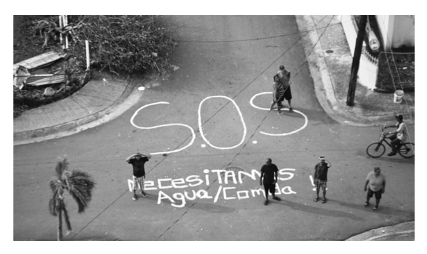
1.7 Humacao, Puerto Rico, September 27, 2017.