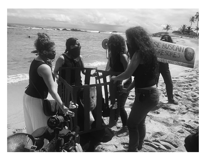
3.1 Si lo ves, arrestalo. La Colectiva Feminista en Construcción. Playa Escambrón, Puerto Rico, April 13, 2017.

increasing proximity among the women performing the arrest, signaling a "gaining of collective consciousness" that turns "accountability into one forced by collective, popular power." <sup>156</sup> La Colectiva's performance staged a transversal interruption of impunity, then, by shifting responsibility for such interruption to all, especially when official processes have failed.