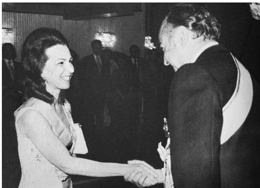
FIGURE 29. President José López Portillo honoring Liudmila Zhivkova, 1978.

In Mexico, the personal engagement of two presidents, Luis Echeverría (1970–1976) and his political ally and successor, José López Portillo (1976–1982), both of the populist and authoritarian PRI, were indispensable. The two actively facilitated contacts with small Bulgaria as described in the memoirs of the Bulgarian ambassador who was dispatched to cultivate those relations. Highly placed women played an important role, too. In 1975, Zhivkova visited Mexico in her capacity as chairperson of the Committee for Culture, the same year the new Bulgarian embassy first opened. In 1976, she attended the inauguration of President López Portillo, in a highly symbolic gesture, and visited again in 1978 and 1981. During those visits, First Lady Carmen Romano de López Portillo hosted receptions, museum openings, and ceremonies honoring Zhivkova; she also paid a visit to Sofia in 1977 and met with a host of Bulgarian officials. 62 The growing fondness between the two women paved the way for the state visits of President López Portillo in 1978 and of General Secretary Zhivkov in 1979. 63 While rhetorically portrayed as the rapprochement between the Mexican and Bulgarian people, the relationship had