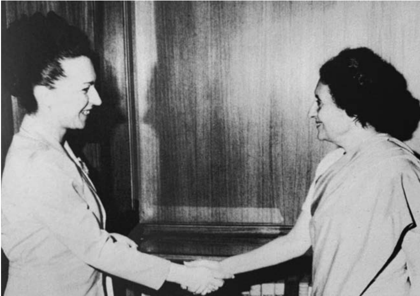
FIGURE 28. Meeting between Liudmila Zhivkova and Indira Gandhi in New Delhi, 1976. Source: Elena Savova, Zdravka Micheva, and Kiril Avramov, eds., Liudmila Zhivkova: Zhivot i delo (1942–1981); Letopis (Sofia: Izdatelstvo na Bălgarskata akademiia na naukite, 1987).

to highly ranked political leaders, party functionaries, diplomats, and their families, plus a growing number of exchange specialists, scholars, artists, and performers. The strong personal relations that developed between political leaders at the highest level was instrumental. 59 A close friendship flourished between Gandhi and Zhivkova, both daughters of leaders who had taken their countries in radically new directions. Their personal patronage played an important part in the intense, cordial relations between the two countries that developed from 1976 on. The two female politicians often made comparisons between the post-1944 socialist period in Bulgaria and the post-1947 independence period in India whose common goals were modernizing their countries and lifting their peoples out of poverty. In the words of Gandhi, “we have pursued different paths but the goal is the betterment of our people’s lives.” 60 In addition, both Zhivkova and Gandhi had an affinity for the use of history in their narratives of political success: while Zhivkova visited museums and historical sites and spoke about the mysterious Thracians and tenacious Slavs, Gandhi visited Hindu temples and used rituals and symbols, including those of Durga, the Hindu mother goddess, to mobilize national(ist) sentiment as a strategy of legitimization. 61 Their view of the transformational role of their families’ political choices and the common use