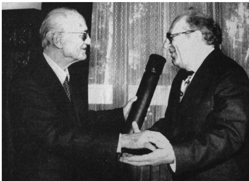
FIGURE 15. Meeting of historian Nikolai Todorov, ambassador to Greece in 1981, and the former Greek prime minister Panaiotis Kanelopoulos, who chaired the Greek National Celebration Committee.

This is not to say that everything went smoothly. The Bulgarian general consul in Thessaloniki, for example, had suggested with nationalist pathos that the 1300-year events in Greece should “disseminate information about the contributions of our country to the international world cultural treasury, countering Greek insinuations that Bulgaria had only consumed Greek values without lending anything to it.” 131 Greek nationalist organizations similarly “accused Kanelopoulos [and others Greek public figures] of selling themselves to the Bulgarians.” 132 When the Greek ambassador in Sofia proposed the organization of an Aegean Civilization exhibition in 1981, “as a greeting to the Bulgarian people for their jubilee,” there were suspicions that the goal was to overshadow Bulgarian contributions to ancient civilization, demonstrated in the blockbuster Thracian Treasures exhibition that toured the world at the same time. 133 Yet, these disagreements were handled