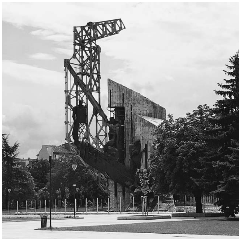
FIGURE 38. The 1300 Years Bulgaria Monument in ruins in 2016.

Throughout the first decade of the twenty-first century various opinions in the press, public forums, and online discussions debated its removal and the reinstatement of the Fallen Soldier Memorial (built in 1934 and removed in 1981), its renovation, or its transformation into a modern outdoors facility featuring climbing walls and skateboarding ramps. 9 In the summer of 2017, despite the protests of cultural figures and campaigns to raise funds for its renovation, the municipal authorities embarked on a month-long removal process, using heavy machinery to take down the solid concrete structure. In November 2017, a small part of the interwar memorial to soldiers fallen in