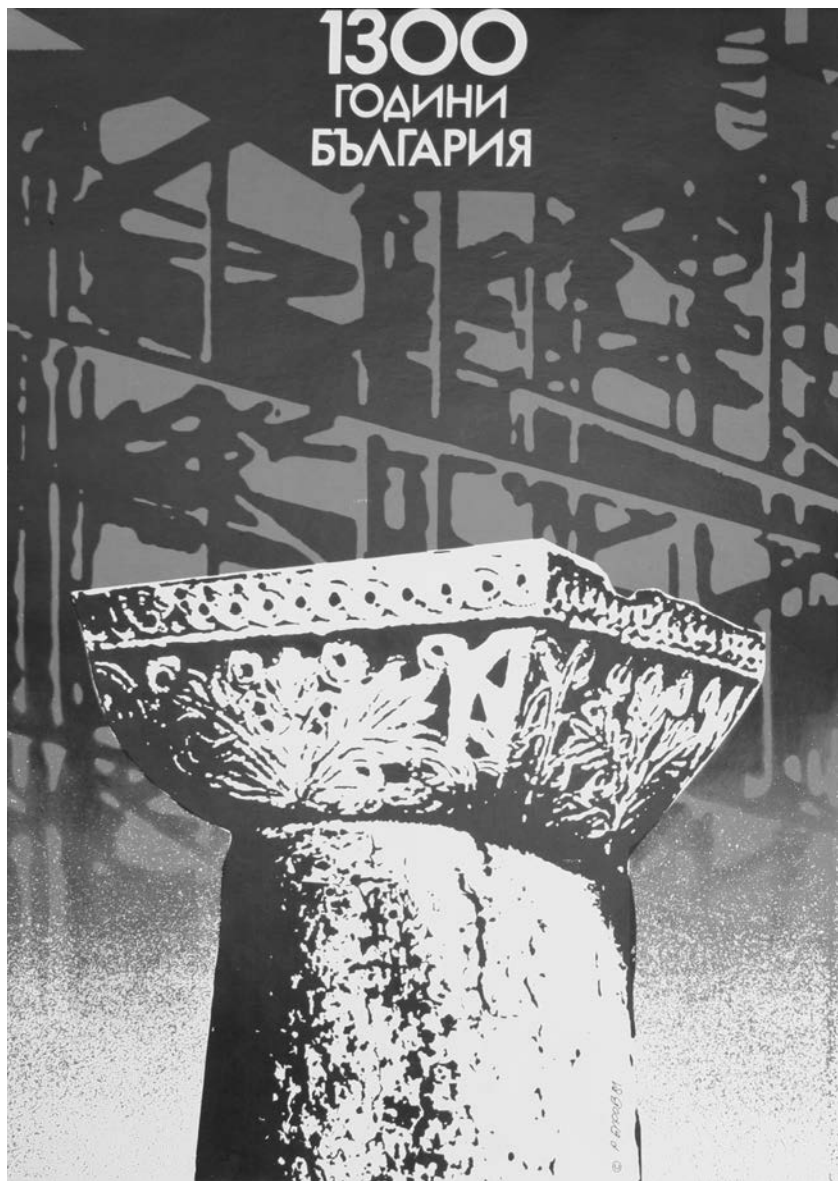
FIGURE 4. 1300 Years Bulgaria poster.

society at home and promote the prestige and agenda of the country abroad; throughout this period, domestic and global agendas went hand in hand, creating a vibrant state-run cultural program that stands out in late socialist Eastern Europe.