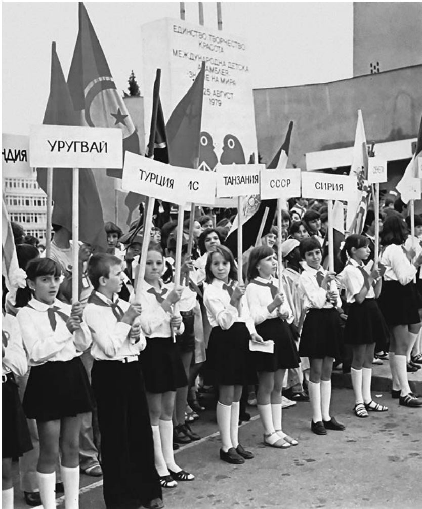
FIGURE 8. Participants in the International Children's Assembly, 1979.

unified culture” that could only be the product of a state-managed system of cultural production that imposed its vision on its citizens without transparency or feedback. 67 As Irina Gigova demonstrates in her examination of Bulgarian writers, cultural practitioners felt that they were constantly under demand to produce for various state-sponsored events, participating in an “endless series of mandatory and carefully scripted official gatherings, conferences, and award ceremonies that kept authors mindlessly busy.” If Zhivkova’s policies were seen as the second golden age by some, for others