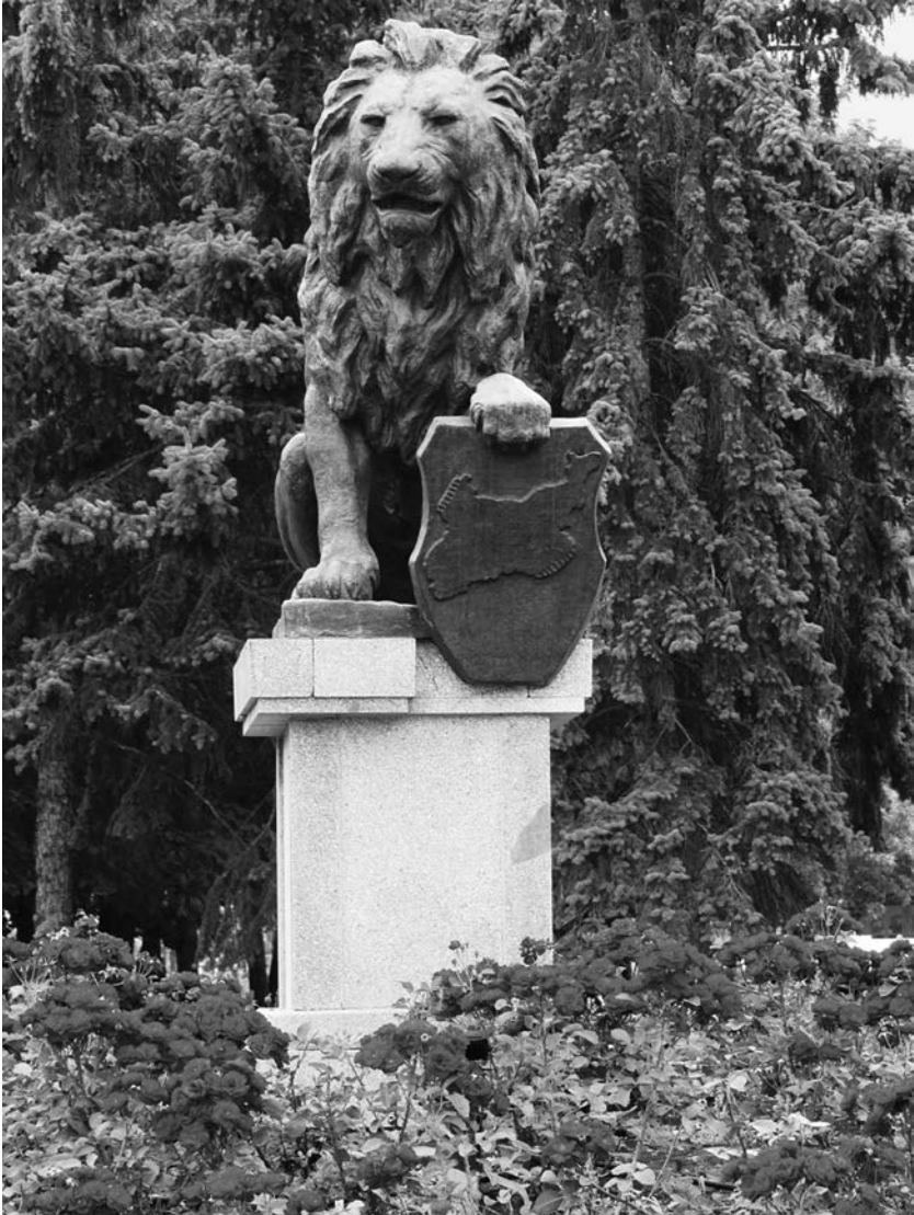
FIGURE 39. The lion of the Fallen Soldier Memorial, installed in 2017 after the removal of the 1300 Years Bulgaria Monument.

the Balkan and First World Wars—a lion holding a shield picturing San Stefano Bulgaria—stood in the middle of a small garden, awaiting the full reconstruction of the monument. 10 Postsocialist anticommunism had defeated socialist-era cultural nationalism by resurrecting an explicitly irredentist monument from the interwar years.