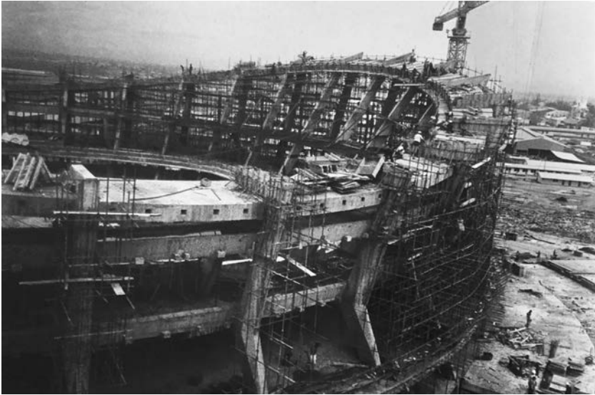
FIGURE 34. National Theatre in Lagos, construction in progress.

In 1972, following the visit of a Nigerian federal delegation, the Bulgarian state construction firm, Technoexportstroy, was chosen to build the new National Theatre in Lagos, on the model of the Palace of Culture and Sports in Varna, to host FESTAC 77. Completed in only two years, this monumental building at the heart of the Nigerian capital was a major accomplishment for a small state that wished to position itself as a development model for the newly independent African states. 39