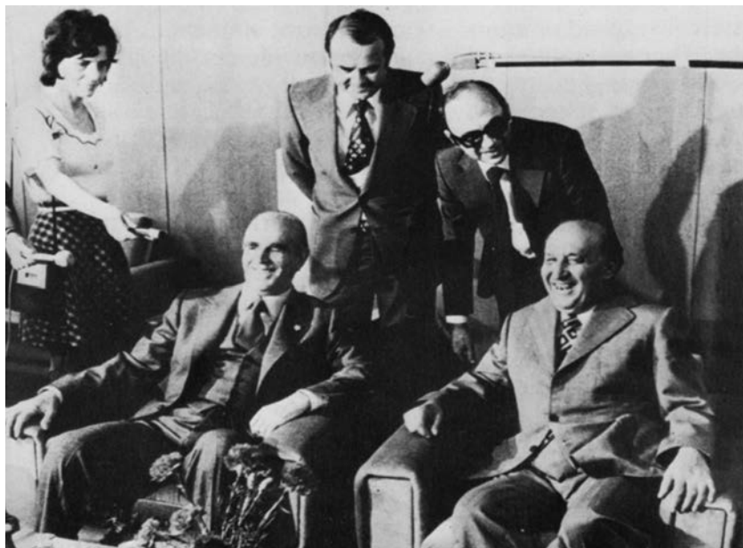
FIGURE 14. Meeting of Todor Zhivkov and Greek prime minister Konstantinos Karamanlis. Undated.

“dynamic [and] well-organized.” In the late 1970s, film festivals, cooperation between Greek and Bulgarian radio and television, and visits of librarians and classical musicians created a lively exchange of cultural events. 121