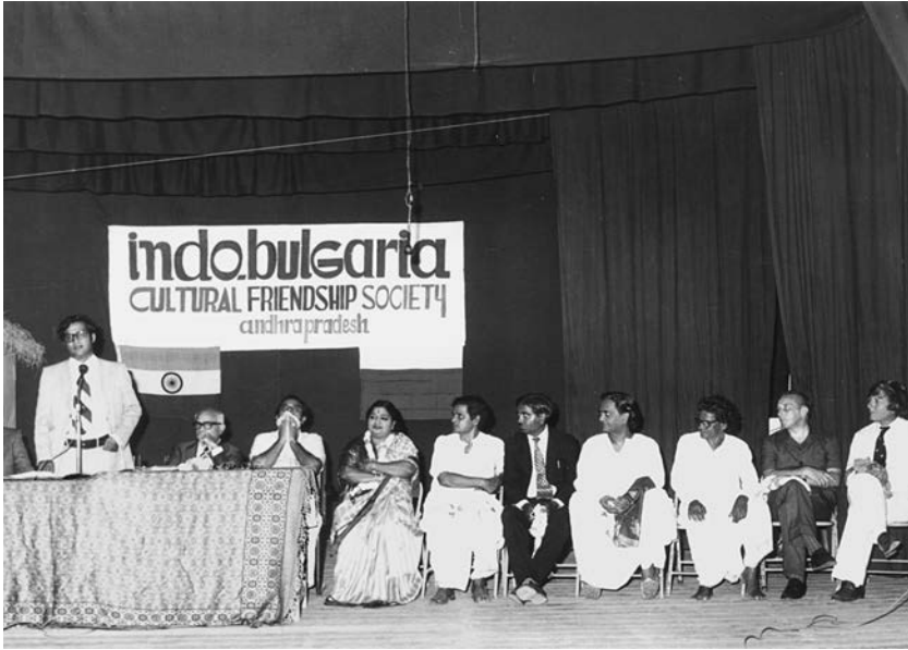
FIGURE 30. A meeting of the Indo-Bulgarian Friendship Society in the state of Andhra Pradesh, most likely in 1978 on the occasion of the Bulgarian centennial.

in collaborating with Bulgarian specialists in the arts and folklore and sought help with the preservation of ancient archaeological sites. 105