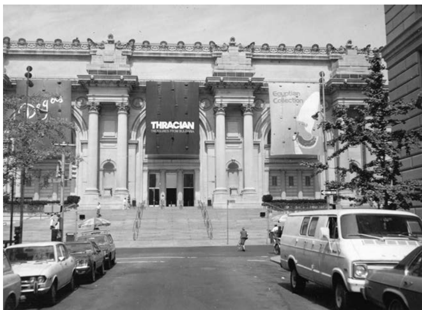
FIGURE 16. A banner for the exhibition Thracian Treasures from Bulgaria , Metropolitan Museum of Art, New York City, June 1977.

The core message of these exhibitions, consistent with the “patriotic turn” and embrace of cultural nationalism in the 1970s, was to display the glorious history of Bulgaria, one of the oldest European states, established in 681. Charting the centuries-long history of today’s Bulgaria, these exhibitions proudly showcased Thracian civilization, the pre-Greek, indigenous populations in the Bulgarian lands. They highlighted the rich Bulgarian medieval tradition, especially emphasizing the Bulgarian role in the preservation and dissemination of the Slavic alphabet and literacy. Icons emphasized the link between religion and nationality, an important marker of Bulgarian national identity. Folk objects showed the authenticity and longevity of the Bulgarian