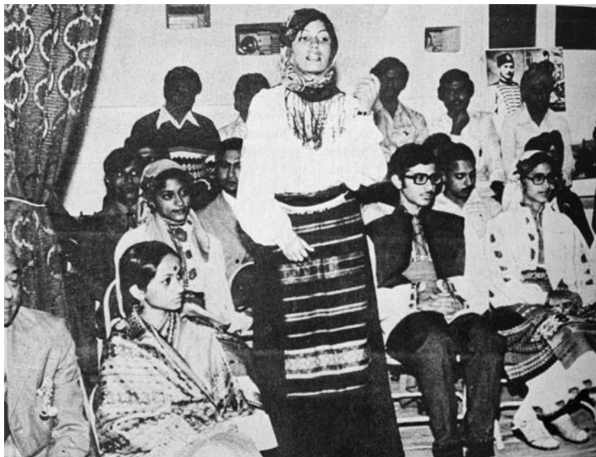
FIGURE 31. Reading of Bulgarian poetry by students at Delhi University.

strategies in the study and preservation of ancient cultures, proposing joint research projects focused on ancient civilizations, and especially cooperation between Bulgarian specialists in Thracology and Indian specialists in ancient Indian cultures. 110 Civilizational agendas were at the core of this cultural partnership.