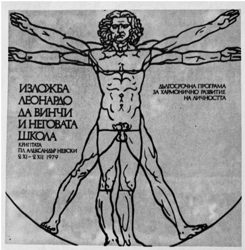
FIGURE 19. Poster for the exhibition Leonardo da Vinci and His School at the Alexander Nevski Crypt, November 1979. Source: Bulgaria Today , no. 2, 1980.

Encouraged by their ability to handle the organization of Western culture at home, in November 1980, Bulgarian officials sponsored a Cultural Week of the FRG. When the proposal for this event was first received, it caused a ripple of panic at MVnR because "we have never had a Days of Culture for a capitalist country." 165 The event opened under the aegis of FRG foreign