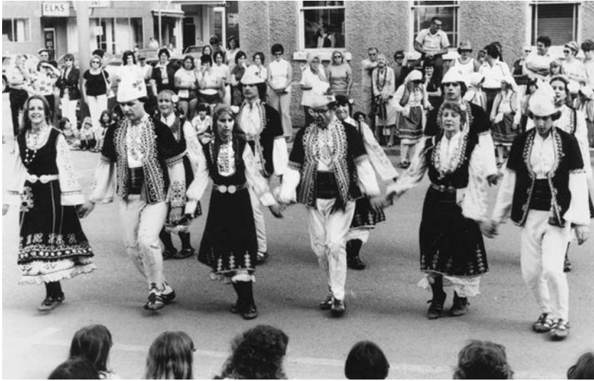
FIGURE 23. A performance of folk ensembles from the Midwest in New Lexington, Ohio, in June 1978.

born in Bulgaria, wished to commemorate the 1300th anniversary by establishing an annual prize fund for art students in Bulgaria. 35 An art enthusiast, Dimitar Batoev, wanted to show his work during a visit to Bulgaria, despite the objection of the Union of Bulgarian Artists (which did not approve of the quality of the artwork), and wrote to Zhivkova personally to lobby for his exhibit. 36 Some Americans, with the urging of their Bulgarian friends, also visited the country and started writing media dispatches and travelogues on Bulgarian topics. 37 As is clear from these examples, the nation-speak of official Bulgaria had resonance among some members of the colony in the United States. As celebration of the 1300th anniversary ignited national pride and Bulgarian diplomats provided organizational and financial resources, grassroots reactions revealed that a Bulgarian diaspora, united through nation-speak, was now in the making.