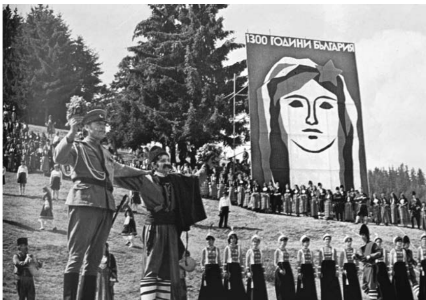
FIGURE 11. The Rozhen Folk Fair held under the auspices of the 1300th anniversary, featuring a giant banner honoring the jubilee.

the establishment of the People's Republic of Poland in 1966 as the peak of the millennium celebration. 78 Experts paid close attention to the role of the "reactionary and fanatic" Catholic clergy, which had tried to "divide the population into religious and non-religious" through the organization of alternative, church-led millennial events; they tried to anticipate similar difficulties in Bulgaria due to the similarly prominent role of the Orthodox Church in Bulgarian history. 79 Finally, the mass participation of a large number of émigrés in the millennial celebrations had highlighted the "moral and political unity of [Polish] society," an appealing example for the Slavic Committee, the official Bulgarian organization for Bulgarians abroad, which similarly tried to rally the Bulgarian diaspora. 80