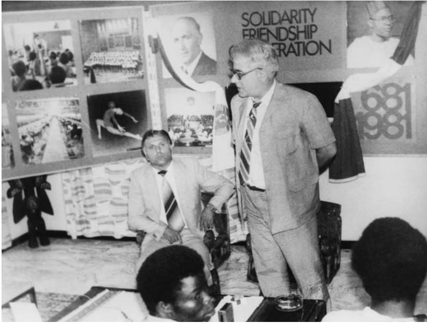
FIGURE 36. Photo exhibition and discussion held on occasion of the Twelfth Congress of the BKP and the 1300th anniversary in Lagos, April 1981.