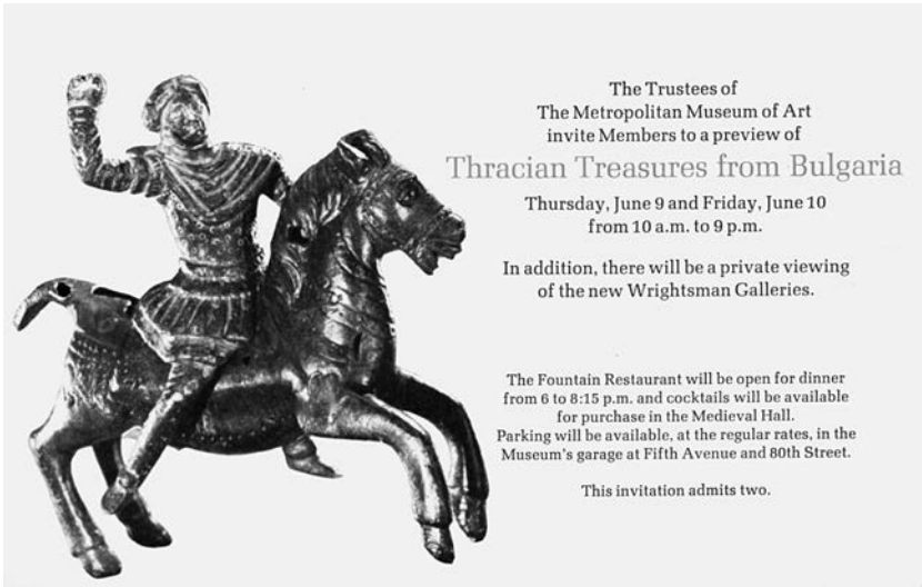
FIGURE 18. Invitation to the opening of Thracian Treasures from Bulgaria at the Metropolitan Museum of Art.

Center in Washington, DC. 112 From the Bulgarian perspective, these events constituted a true breakthrough in their relationship with their prime ideological adversary.