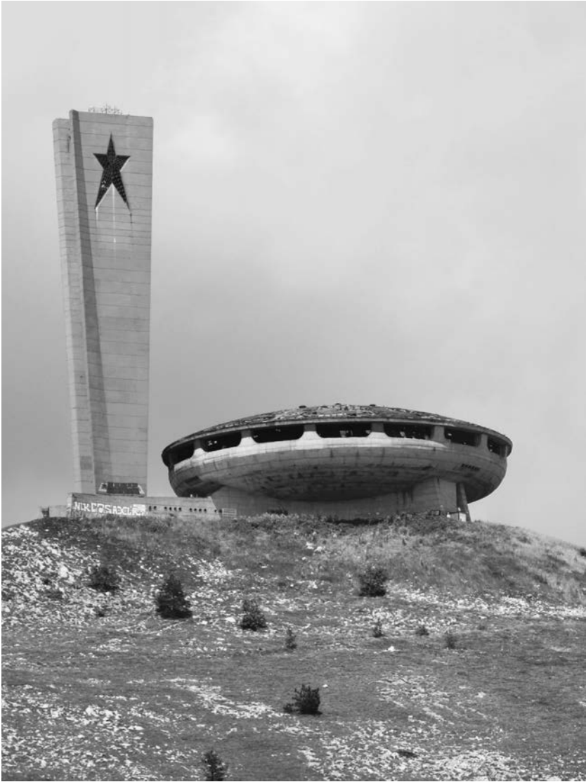
FIGURE 40. The Home Monument of the Party on Buzludzha in summer 2019. The graffiti, damaged ceiling, and missing red star are visible even from a distance.

building of the former Gallery for International Art. This building had first opened in 1985 to showcase the cultural endeavors initiated by Zhivkova. At the time, it represented the first systematic showing of foreign art. 16 The current museum features an eclectic collection of Bulgarian, European, and world art. Notably, it houses numerous works of Russian-Indian artist