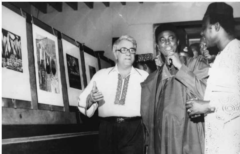
FIGURE 5. Opening of the exhibition Contemporary Bulgarian Print Makers in Lagos, April 1980.

presence in the Soviet Union and the rest of the socialist states. Bulgarian cultural events of the 1970s often followed templates of socialist solidarity established in the late 1940s; Red Army parades, World War II memorials, and Bolshevik Revolution celebrations remained a permanent staple of the Cold War cultural landscape. All socialist countries had cultural-informational centers in other socialist capitals that coordinated activities while cultural attachés from throughout the bloc met regularly to discuss common strategies of cultural exchange.