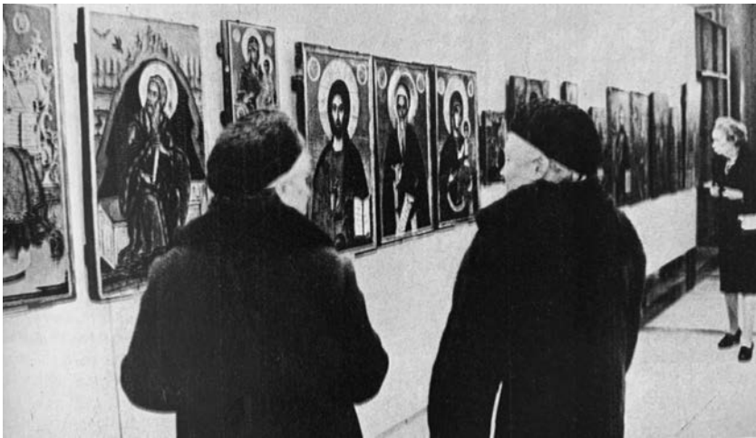
FIGURE 17. The exhibition 1000 Years of Bulgarian Icons in Vienna, 1977.

In the case of the FRG, the development of cultural and political relations went hand in hand. Two cultural events framed the reestablishment of political relations between Bulgaria and the FRG. In January 1972, in the midst of diplomatic activity behind the scenes, an exhibition of West German artists opened in Sofia. For the Bulgarians, "this exhibition is still another step toward the further expansion of cultural relations between the two countries and will contribute toward their knowing each other better." For the West Germans, "this is a premiere, which will be followed by a number of other manifestations in that direction." 102 The official establishment of diplomatic relations between the two countries occurred in December 1973. In February 1974, another exhibition, Architecture, Urbanization, and the Restoration of Cities in the FRG , opened in Sofia. 103 Once set in motion, culture played an important part in the normalization of relations. The federal structure of the FRG presented advantages as it allowed the organization of events without the pitfalls of demands for reciprocity. In 1979 and 1980, Thracian Treasures toured Cologne, Munich, and Hildesheim to great acclaim. At the exhibition opening in Cologne, Zhivkova met with Chancellor Schmidt. Some 197,500