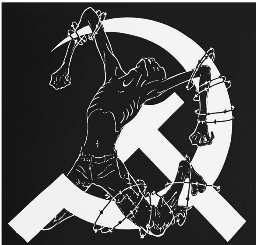
FIGURE 22. The cover of the magazine Borba (Struggle), November 1981, published by the Bulgarian National Front in Chicago, featuring an unambiguously anticommunist message.

Yet, national(ist) considerations could moderate the treatment of technically anticommunist yet otherwise patriotic émigrés by following a tortuous logic of compromise by necessity. In the 1970s, Bulgarian officials started treating discrete groups of émigrés who had fled the country after 1944 due to their (at the time) anticommunist agenda more favorably. One notable example were the members of the pro-Bulgarian Macedonian Patriotic Organization (MPO) in the United States and Canada who continued to nurture