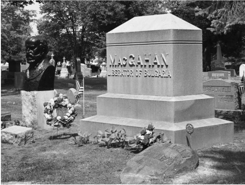
FIGURE 25. MacGahan's original monument at the New Lexington cemetery (right) and the replica of the monument from Batak, Bulgaria (left).