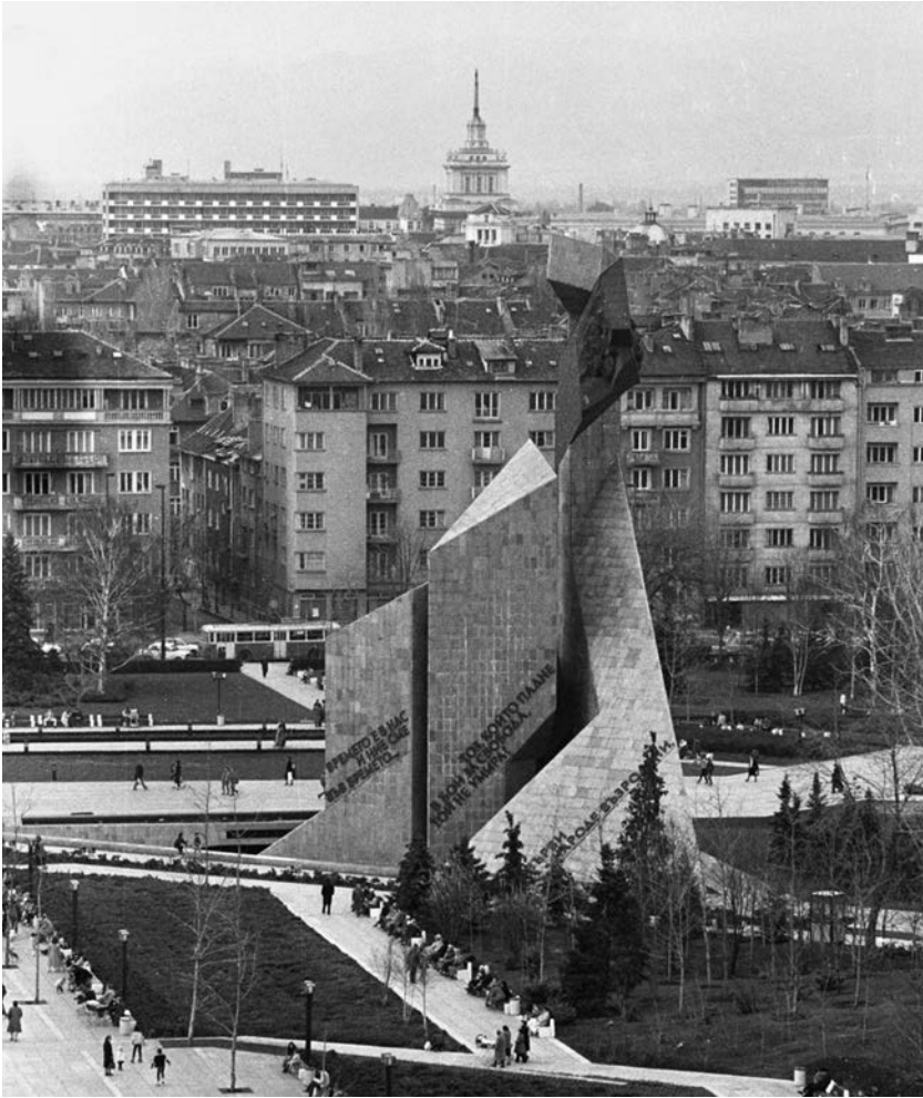
FIGURE 10. The 1300 Years Bulgaria Monument in the NDK park, 1981.

States as the three models that most fit their needs, while also singling out two counter-models of practices to avoid, those of Belgium and Romania. Surprising cultural partnerships and unlikely exchanges of ideas framed the conception of the “big event.”