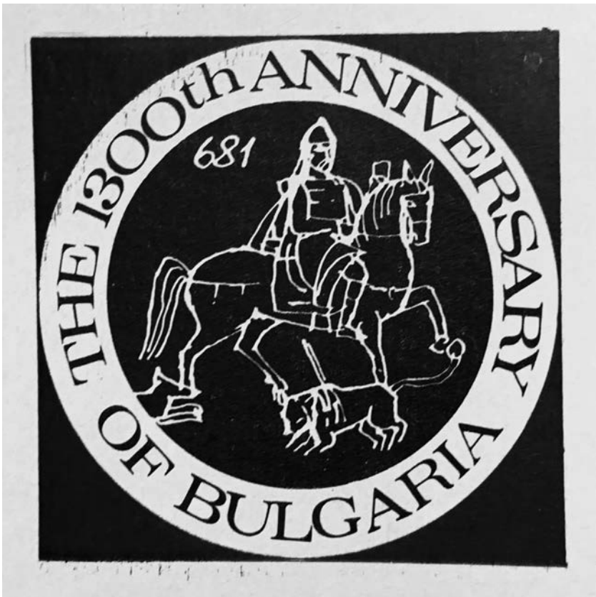
FIGURE 12. Logo for the 1300th anniversary featured in official Bulgarian publications for foreign audiences, such as the magazines Bulgaria Today and Slaviani .

With these plans in hand, in the period between 1977 and 1981, Bulgarian officials organized more than 38,000 cultural events abroad. Bulgarian