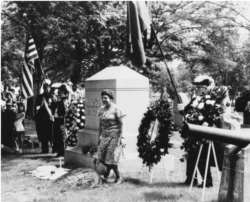
FIGURE 24. The celebration of the centennial of Januarius MacGahan’s death in New Lexington, Ohio, in June 1978.