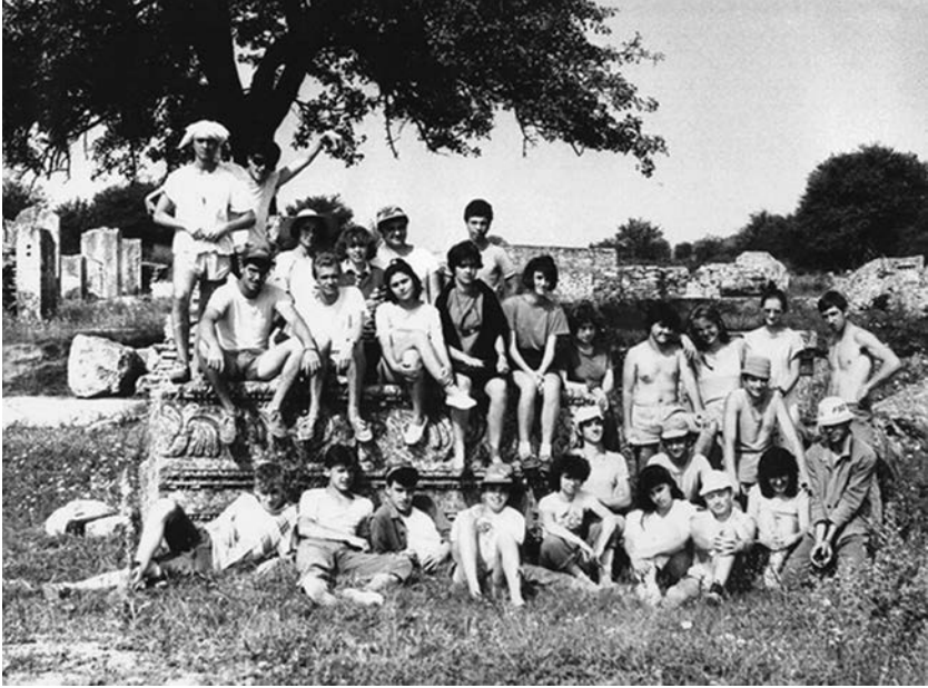
FIGURE 3. The author and other students from the classical high school at archaeological excavations at Nicopolis ad Istrum, summer 1989

the German Burda magazine in hand, we took the cold bus across town to a high-rise on the outskirts of Sofia where a kind, middle-aged seamstress, looking to make extra cash, made what I considered a mediocre dress. My mom saved the situation again by borrowing a corduroy trench coat from a family friend, so I could cover up the dress. When my classmates started showing up for prom, it transpired that some families had done extremely well under the transition—they sported flashy foreign-bought outfits that screamed Western consumerism and capitalist prosperity.