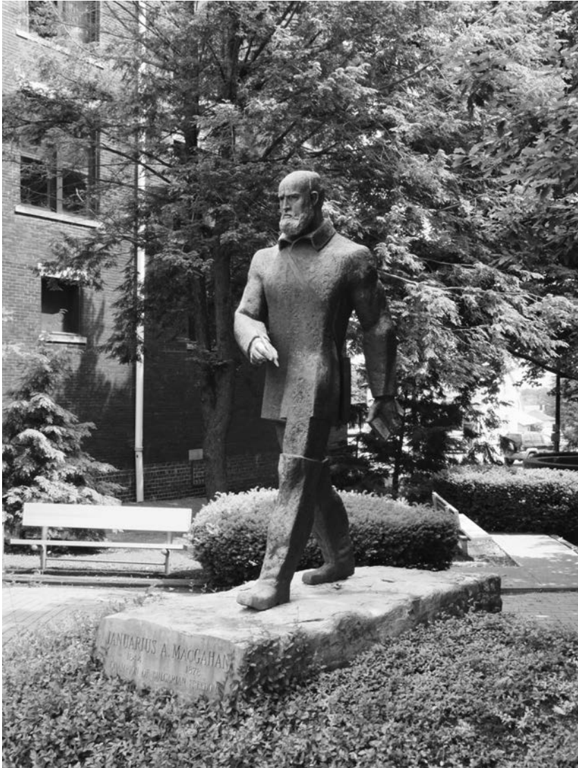
FIGURE 26. The statue of MacGahan by Bulgarian sculptor Liubomir Dalchev, who defected in 1978 and immigrated to the United States.

New Lexington. 65 In a manifestation of “productive friction,” official Bulgarian cultural objectives intersected with local community interests and émigré national sensibilities. The representatives of the NRB had to participate in awkward cultural encounters involving Orthodox priests and Bulgarian émigrés. Still, New Lexington became one of the main destinations for official Bulgarian