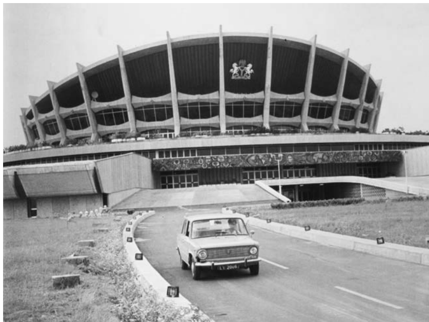
FIGURE 35. The National Theatre in Lagos, which was at the center of the FESTAC 77 celebrations.

In many ways, this cultural project, even though based on ideas of Pan-Africanism and Blackness, shared commonalities with Bulgaria's 1300-year jubilee in its attempt to use culture as political capital domestically and internationally. Apter's analysis is particularly helpful here, as it is based on fieldwork conducted in Nigeria during and after FESTAC 77. Like Bulgaria's state-sponsored celebrations of the establishment of the Bulgarian state in 681, FESTAC was a "national campaign" orchestrated by "an ideological state apparatus" led by "specialists" whose job was to promote "a cultured appreciation of national culture among the masses." 72 Just as Bulgarian officials emphasized the ancient past, Nigerian officials sought to highlight "the rich and ancient heritage which has produced our complex nation," as head of state General Mohammed declared in 1975. 73 Bulgaria's preoccupation with "representative exhibitions" was echoed by Nigerian cultural experts, who put together a spectacular exhibition, 2000 Years of Nigerian Art , which toured internationally to showcase the unity of the Nigerian nation. The director of the Nigerian National Museum, Ekpo Eyo, explicitly used arts, archaeology, and culture as a tool for building a common national identity and conveying to the public the "underlying philosophical and psychological basis providing a common root" for all Nigerians. 74 This emphasis on