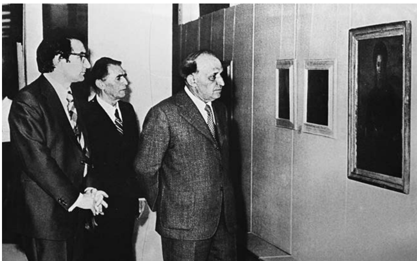
FIGURE 13. Todor Zhivkov during an exhibition in the company of Svetlin Rusev, chairman of the Union of Bulgarian Artists. Undated. Zhivkov liked to be seen as a cultural benefactor.

The most visible member of the third generation was Liudmila Zhivkova, whose meteoric career caused much fascination, both domestically and internationally. She became highly visible in 1971 (at age twenty-nine) when she became acting first lady following her mother's death, a status augmented by her appointments as the chairperson of the KK in 1975 and a member of Politburo in 1979, positions she held until her death in July 1981 (at age thirty-nine). There is some discussion in the Bulgarian literature about whether she executed policies of "enlightened absolutism" that benefited the public or used her family background to advance personal agendas in the worst manifestation of the dynasticism and nepotism of communist elites. Her depictions in Bulgaria at the time remained dogmatic and, after her death in 1981, hagiographic. 97 But details of her biography did not follow the conventional expectations of communist elites: in one example, she did her PhD in Oxford, not in Moscow. Further, her idiosyncrasies—her practice of yoga, meditation, and theosophy; her unconventional clothing and diet; and her rumored close relation with a famous Bulgarian clairvoyant, Baba Vanga—have produced prolific scholarly and popular writing. 98