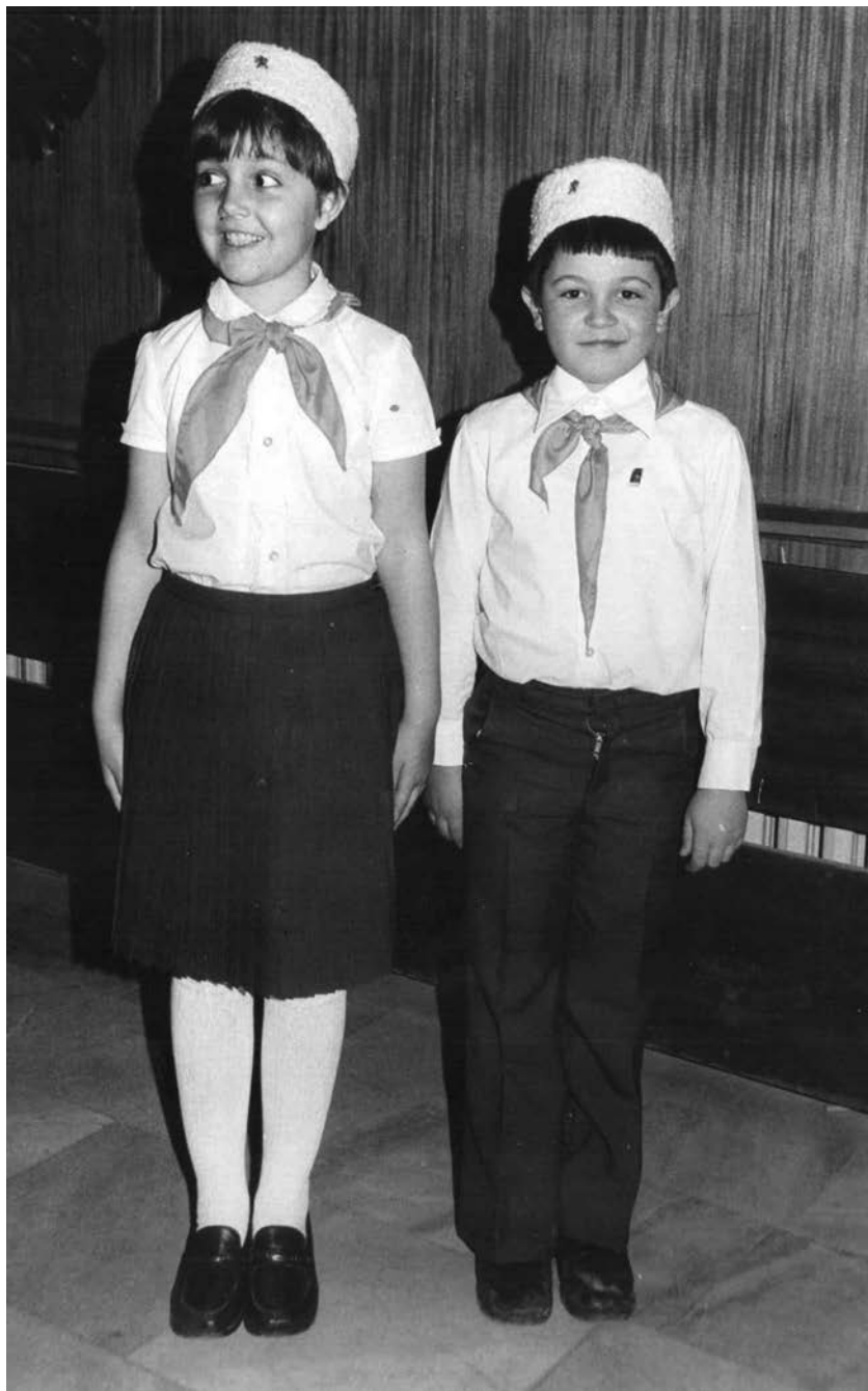
FIGURE 1. The author at a celebration of the Bulgarian children's mass organization, Chavdarche, likely in 1982