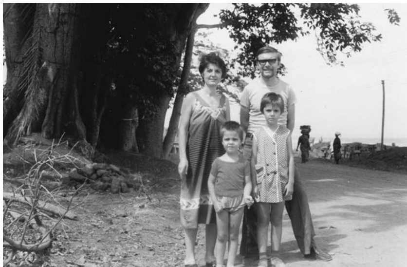
FIGURE 2. The author's family in Nigeria, 1979

Delphi, and Olympia, but during our free time we went shopping for discounted clothing. Up until 1989, uniform rules were strictly enforced while the teachers ignored the pushkom (smoking committee) across the street or the miniskirts and jeans some students wore under their uniforms. As a special school, we were spared the obligatory summer harvest-picking brigades because we went to archaeological excavations instead, but we still attended military camps where we fired Kalashnikovs and slept in enormous, unsanitary barracks with dreadful bathroom facilities.