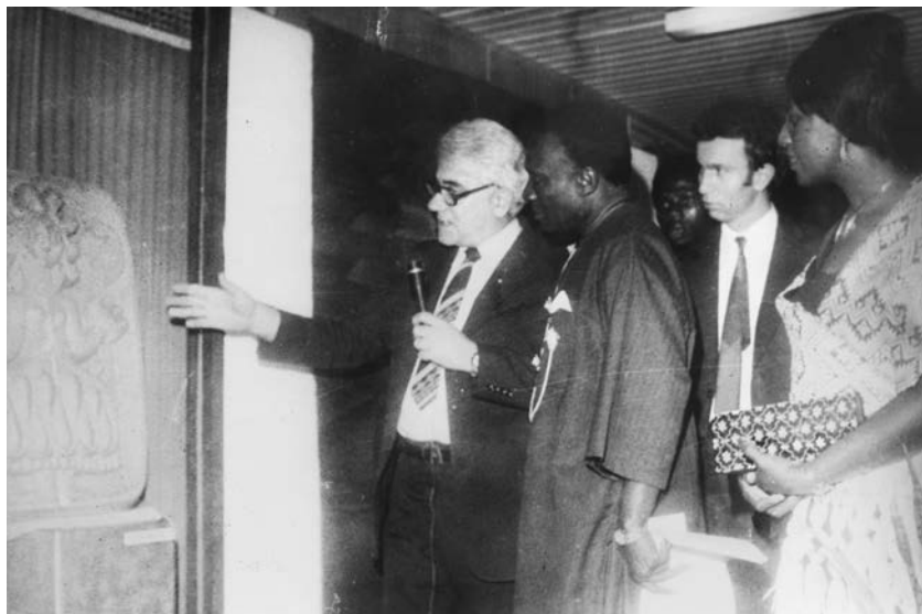
FIGURE 37. Opening of an exhibition featuring Bulgarian art, December 1981.