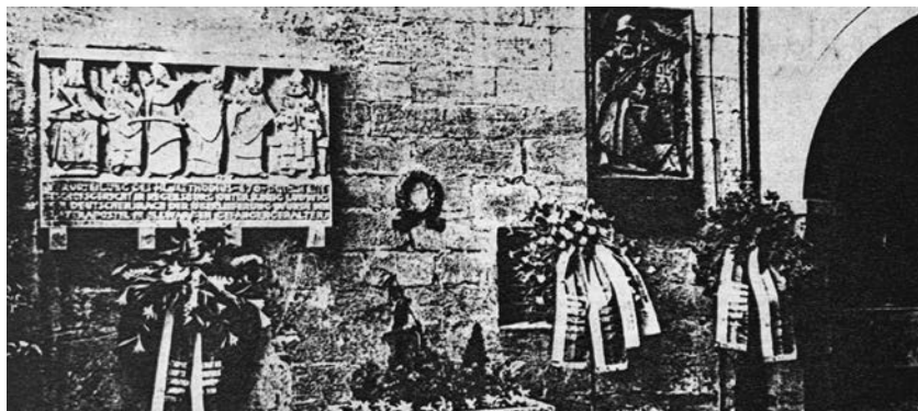
FIGURE 27. The bas-relief of Methodius ( right ) at the cathedral of Ellwangen, Germany, next to the original memorial plaque ( left ). Wreaths placed by members of the Iavorov Cultural and Educational Society in Stuttgart are visible.

Similarly to New Lexington, Ellwangen became the site of “productive friction” and contested encounters between representatives of official Bulgaria and loyal or hostile émigrés while the intrinsically religious site added one more layer to these already loaded contacts. In 1977, during a wreath-laying ceremony at Methodius’s memorial plaque, members of the “hostile emigration” brought their own wreaths and distributed flyers with an anticommunist message (the embassy duly attached a copy of the flyer to its report, but it is missing from the archival records). 68 The actions of such organizations were thus always on the mind of Bulgarian officials as they organized their “patriotic” celebratory activities.