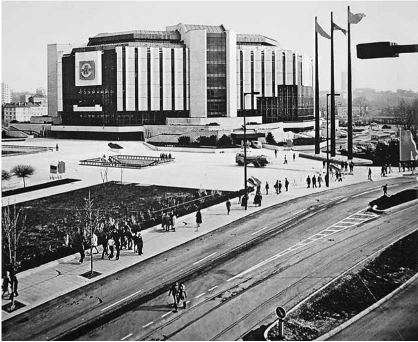
FIGURE 9. The People's Palace of Culture (NDK) in 1981 when it first opened to host the Twelfth Congress of the BKP and the 1300 Years Bulgaria celebrations.

the “big event” and established a commission that circulated a number of “idea plans” ( ideĭni planove ) for the jubilee. In 1978 the National Coordinating Committee 1300 Years Bulgaria (NKK), under the leadership of Liudmila Zhivkova, took charge of organizing the domestic and international programs associated with the anniversary. In November 1978, the NKK accepted the National Program for the Development and Coordination of Activities Related to 1300 Years. Planning for the big event sped up in 1980: in April, the KK and NKK signed off on the calendar of anniversary activities and in October they affirmed the program of important events for 1981. Many of the celebrations were conceived as “complex events” that combined diverse genres and audiences to create a lasting “multiplication effect.” 73 Overall, the NKK coordinated over 3,500 meetings of various institutions and created a planning template for celebratory events. Bulgarian officials designed what can be likened to target plans for jubilee events; these “jubilee plans” were written by each state institution, sent to the NKK for approval, and required a final “general report” detailing the rationale and execution of the plan. The total cultural mobilization of the nation was underway.