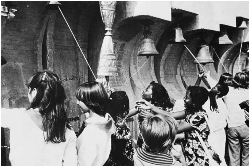
FIGURE 6. Children visiting The Bells monument on the outskirts of Sofia in 1981, built on the occasion of the International Children's Assembly in 1979.

As a result of expanding cultural cooperation, there was an increase in Bulgarian events organized in the West. Bulgaria had long-standing cultural contacts with Austria and France, two countries where many members of the Bulgarian national intelligentsia had received their education in the late nineteenth and early twentieth centuries. Bulgarian musicians, artists, and